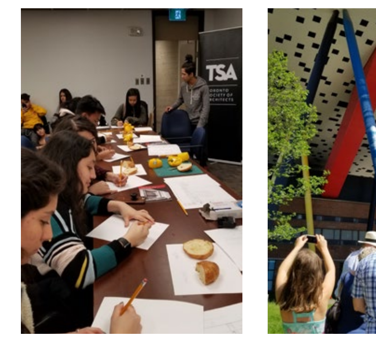
(Top) The historical Heliconian Hall set the perfect mood for our joint lecture on Death and the City. (Bottom Left) Students draw plans and sections of pastries as part of our TDSB Student Workshop. (Bottom Right) TSA Tour